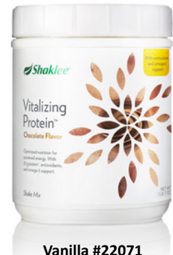
Vanilla #22071 Chocolate #22072

Optimized nutrition for sustained energy. This great-tasting daily protein can be used as part of a healthy lunch or dinner or as an on-the-go snack to help keep you energized and satisfied throughout the day.